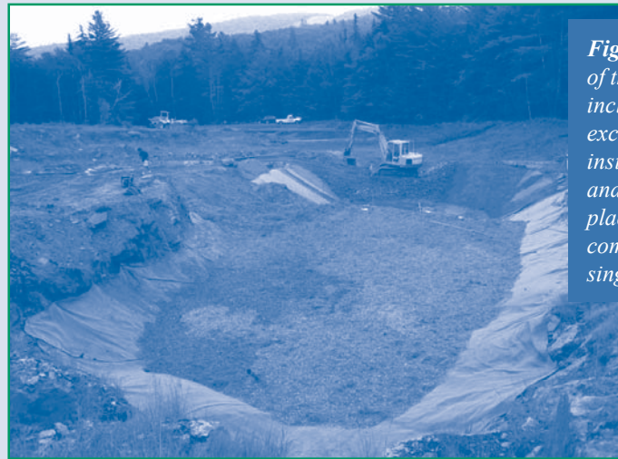
Figure 3. Construction of the Ore Hill BCR, including sediment excavation, lining installation, plumbing, and reactive substrate placement, was completed within a single month.

During the 2006 excavation, a previously undiscovered adit was encountered. Seep from the adit flowed at a rate of 1 gpm across 200 feet of bedrock into a shallow pond within a former quarry pit (covering approximately 50 by 100 feet and extending 15 bgs) before continuing downgradient. As an interim effort to slow surface water movement and control erosion, 13 sediment check dams were installed within the tailings excavation area.