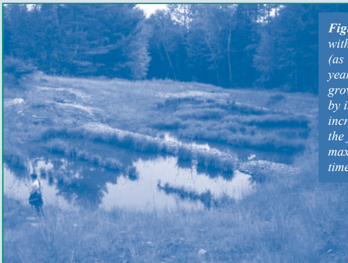
Figure 4. Circulation within the wetlands (as depicted after one year of vegetative growth) is enhanced by inner berms to increase the length of the flow path and maximize residence time of MIW.

MIW began flowing through the complete PTS in September 2009. Upon exiting the PTS, the treated water flows along an existing surface water channel and enters Ore Hill Brook approximately 300 feet downgradient.