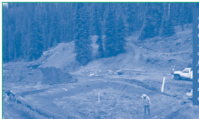
Figure 2. The biochemical reactor occupies a 35- by 35-foot area approximately 200 feet from the mine adit and 25 feet upgradient of the aerobic polishing cell.