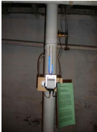
Figure 2. Instruction sheet with basic information about the system, explanation on how to respond to an alarm alert, and contact information.

Municipal permit inspections were performed by the local jurisdiction's building department. After a system had operated for about two weeks, its baseline vacuum pressure was measured by the manometer as 1 to 2 inches of water column and recorded. A final PFET was performed at that time using the permanent monitoring points to confirm an adequate negative pressure field was present under the slabs. A minimum vacuum pressure of 0.004 inches of water column (1 Pascal) was considered adequate and achieved in all systems. Since a negative pressure was being applied, a backdraft test was conducted in each building to ensure noxious gases from the HVAC system would continue venting outside the building.