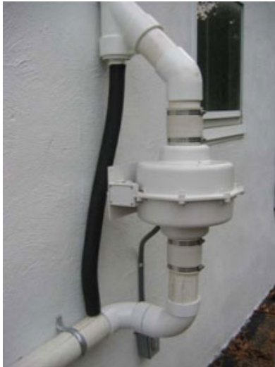
Figure 1. Configuration of exterior components in each installed VI mitigation system.

The SSD systems were of a typical design that includes four-inch-diameter PVC piping installed through the basement floor and into the sub-slab extraction pit. The piping routes outside the home and attaches to a single, continuously operating low-pressure mitigation fan (typically 90 watts). Piping extends from the fan to above the roofline, where vapors discharge to the atmosphere.