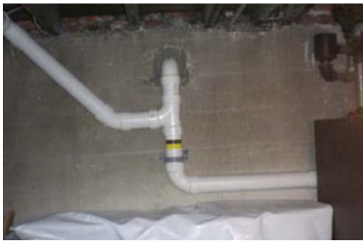
Figure 2. SMD and SSD vent lines, penetrating the concrete foundation wall.

Mitigation systems were installed in 24 residences (including 14 pre-emptive mitigation systems) and one commercial building over the three-year investigative period. These buildings included single-level residential, multiple-level residential, and commercial structures with poured concrete, block, and brick foundations. Basements and/or crawlspaces were present in each building. The type of mitigation system selected was based on the number of buildings over the plume, their size and basic structure, and the presence of unsaturated and semi-permeable soils below the slab.