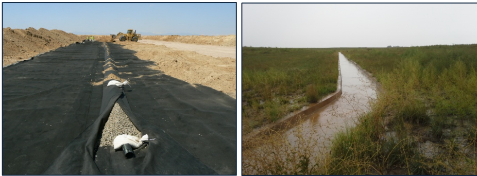
Figure 4. Broken-back design and low-slope drainage provided by 6-inch-diameter slotted pipe secured beneath 4 feet of soil overlain by concrete channeling; the September stormwater drained effectively through the channels, despite heavy saturation of surrounding soil.

The landfills' leachate collection systems and leak detection/collection systems are monitored monthly. Monitoring of the RCRA-equivalent covers includes monthly collection of lysimeter data indicating percolation rates, annual quantitative inspections of the vegetation, and visual inspections at least seven times each year for erosion, burrowing animals and overall integrity. Total soil loss and/or settlement of each cover is monitored through use of erosion monuments to help identify needed repairs relating to rills, gullies, excessive sheet erosion, settlement and apparent ponding. In addition, data from a network of water-content reflectometers placed within the soil profile of one cover are collected continuously and analyzed quarterly to monitor moisture content and migration at 6-inch intervals throughout the 4-foot-thick soil layer.