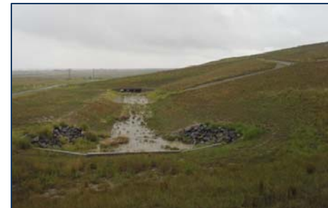
Figure 3. Stormwater runoff carrying loose sediment, which settled within downgradient ends of the concrete drainage channels.