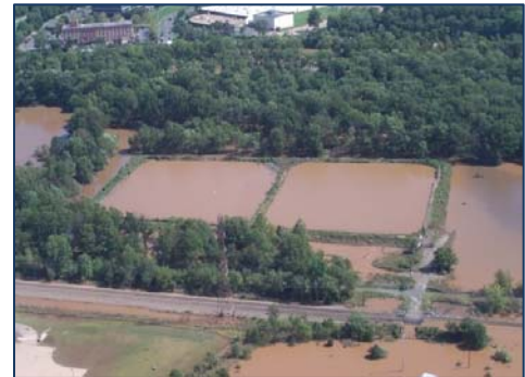
Figure 3. Area comprising impoundments 1 and 2 that remained flooded two days after the peak of Hurricane Irene flooding.

The potential for a surficial release or catastrophic failure of the berms surrounding impoundments 1 and 2 was a concern during the flood (Figure 3). These impoundments are located in the site's south area, approximately 700 feet from the river and outside of the site's flood control berm. Unreinforced earthen berms were constructed around the two adjacent impoundments in the mid 1900s to contain waste and control floodwaters. Before the floodwaters receded, surface water samples were collected from standing water in the vicinity of the impoundments and from downstream points of the Raritan River. Results from the post-flood surface water sampling and berm inspections indicated that a significant release did not occur.