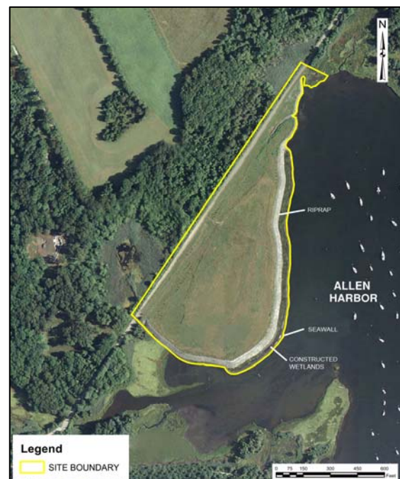
Figure 1. Allen Harbor Landfill boundary and its proximity to Allen Harbor. Riprap protects the landfill face.

The U.S. Navy, working with EPA and other federal and state partners, integrated shoreline armoring structures, including a line of riprap, wetlands and a seawall into the remedial design of a coastal landfill at the former Davisville Naval Construction Battalion Center (NCBC) Superfund site. The structures are designed to protect the landfill face from erosion through wave action, tidal forces and storm surges in the adjacent Allen Harbor. The harbor is located on the western shore of Narragansett Bay, Rhode Island, and surrounds the landfill on three sides (Figure 1). A 3-foot deep multimedia cap installed concurrently reduces the potential for leachate generation from precipitation, while its placement at the 100-year flood elevation level ensures its continued integrity during smaller, more frequent storm and flooding events. The storm mitigation measures are expected to provide long-term protection for human and ecological exposure to landfill contaminants with minimal contaminant migration into Allen Harbor.