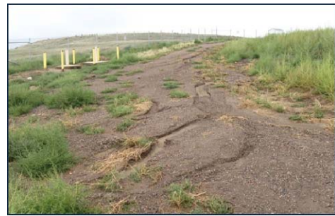
Figure 2. Rill erosion at the capped landfills, primarily on access roads.

Also, erosion controls for the RCRA-equivalent covers were designed to limit overland flow lengths to 500 feet, which minimizes rill and gully formation. Their designs reflect an overall slope of 3 percent in a "broken back" configuration involving drainage channels cut through the covers (Figure 4). A total of 2.5 miles of drainage channels, ranging from 150 to 2,246 feet in length, were installed at grades of 0.3 to 1 percent across the 450 acres. The covers' ability to withstand extreme wind and precipitation and related erosion is reinforced by their ground surface vegetation. It comprises a diverse mixture of shallow- and deep-rooted native plants intended to maximize water removal and increase resilience to indirect effects of a changing climate; effects could involve pathogen and pest outbreaks or land surface disturbances such as wildfires and wildlife overgrazing.