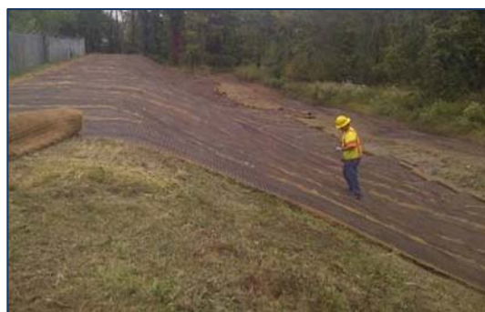
Figure 6. TRM strips approximately 6.5 feet wide deployed vertically along the outer portion of the berms surrounding impoundments 1 and 2 and anchored with metal pins prior to revegetation.