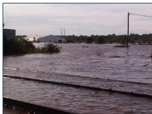
Figure 1. Raritan River from its typical elevation of approximately 18 feet above mean sea level to an elevation of 42 feet during Hurricane Irene, which inundated the north area of the American Cyanamid site with five feet of standing water after floodwaters receded.

Hurricane Irene struck the coast of New Jersey in late August 2011. On August 27, associated floodwaters overtopped a 100-year flood control berm that surrounds much of the American Cyanamid site, a 435-acre National Priorities List site located along the Raritan River in central New Jersey's Somerset County. Approximately 214 million gallons of standing water remained in the site's north area as floodwaters receded (Figure 1). Due to the potential for major storm events to occur in the future, extensive flood plans were developed approximately six months later to integrate preparedness procedures, evacuation plans and post-flood response requirements into site operations. A number of adaptation measures were implemented throughout the site to increase its flooding resilience and improve flood response efforts. Flood mitigation measures were also integrated into the preliminary design of a remedy selected in 2012, which addresses six impoundments, site-wide soil and groundwater.