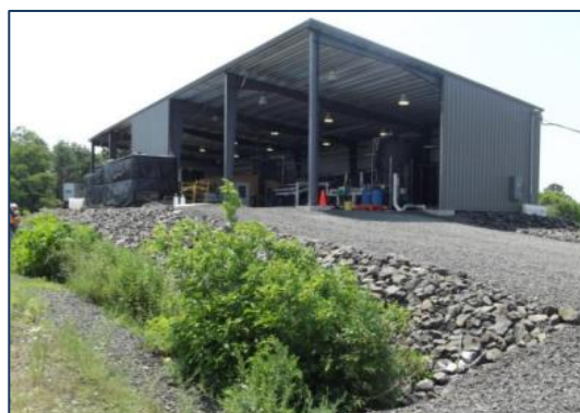
Figure 5. Elevated groundwater treatment plant constructed as part of an EPA removal action; the treatment process includes metals precipitation, filtration and carbon adsorption.

A major goal of the OU4 remedial design is to minimize loss of the site's floodwater storage capacity so that flooding of downstream communities is not exacerbated. Potential measures include constructing a natural stormwater management system and removing the site's flood control berm, which would increase the flood storage capacity by over 200 million gallons during more common flood events. The OU4 remedial design as well as general site operations were not modified due to experiences associated with the more recent Hurricane Sandy along the New Jersey coast, which generated less than three inches of precipitation at this site.