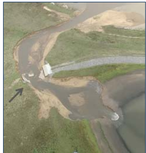
Figure 1. Overflow of the arsenal's network of stormwater holding ponds due to record-breaking rainfall and subsequent rupture of the Havana Ponds dam used for controlled release of the stored water.

On September 12, stormwater surging onto the arsenal caused a breach of the downgradient Denver-owned Havana Ponds dam inside the wildlife refuge (Figure 1). Associated currents carved an 8-foot-deep gully through the refuge and washed out roads, trails and other local infrastructure. More than 400 acres of the refuge were submerged