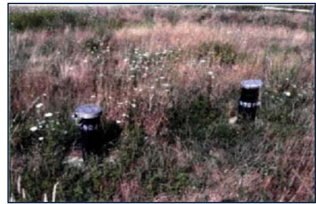
Figure 4. Vegetation cover and monitoring wells on Allen Harbor Landfill.

The remedy also included placement of riprap along the entire shoreline of the landfill to stabilize and protect the landfill from erosion during tidal rise and storm surges. Riprap on the eastern shore consists of 3,000-pound, 6-foot thick armor stones from about 15 feet above MSL to sea level, while stones at the same level on the northern and southern shores have a 1- to 2-foot average diameter. Smaller stones of an average of 3- to 6-inch diameter were emplaced from sea level to about 15 feet below MSL. A layer of small, 1-inch minimum size filter/bedding stone underlies the riprap.