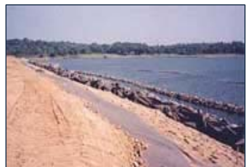
Figure 3. Soil cap at Allen Harbor Landfill soon after completion and prior to planting vegetation.

The multimedia cap was constructed in areas above the 100-year flood elevation, at 14 feet above mean sea level (MSL) and higher, to avoid compromising the long-term effectiveness of the cap from hydrostatic pressure on the liners during floods. The remainder of the landfill is covered with a soil cap (Figure 3). To construct the soil cap, the original soil cover installed in 1972 was regraded, and an additional 18-inch common borrow fill layer was emplaced along with a 6-inch layer to support vegetation. Sediment dredged from the entrance to Allen Harbor was used as grading material whenever possible.