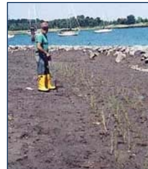
Figure 5. Wetland under construction in front of the landfill cap.

About 1.5 acres of intertidal wetlands on the eastern shore of the landfill were restored by federal and state partners just before cap construction was complete (Figure 5). The work consisted of removing all common reeds ( Phragmites australis ) from the existing impacted wetlands, replacing the adjacent polluted mudflat with a layer of rocks topped by dredge spoils (from the harbor entrance channel), and planting deep-rooted cordgrass ( Spartina ) on the modified surface. A seawall embedded up to 15 feet below MSL and rising to a few feet above MSL separates the wetland from the harbor where the potential for storm surge is highest. The constructed wetland and seawall act together to trip waves and reduce energy reaching the riprap.