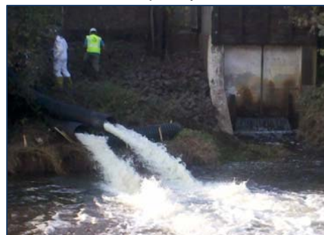
Figure 2. Controlled release of floodwater into Cuckel's Brook at a rate averaging 5,200 gallons per minute, at a location close to the former sluice gate discharge point.

Floodwaters entering the site were prevented from exiting due to an inoperative mechanical sluice gate, which created a "bathtub" within the 10- to 12-foot flood control berm of the 268-acre north area. After analyzing samples of the standing floodwater, it was determined that the controlled release of the floodwater into the adjacent Cuckel's Brook would not negatively impact its water quality. By September 28, approximately 152 million gallons of floodwater had been discharged to the brook (Figure 2) using generator-powered pumps