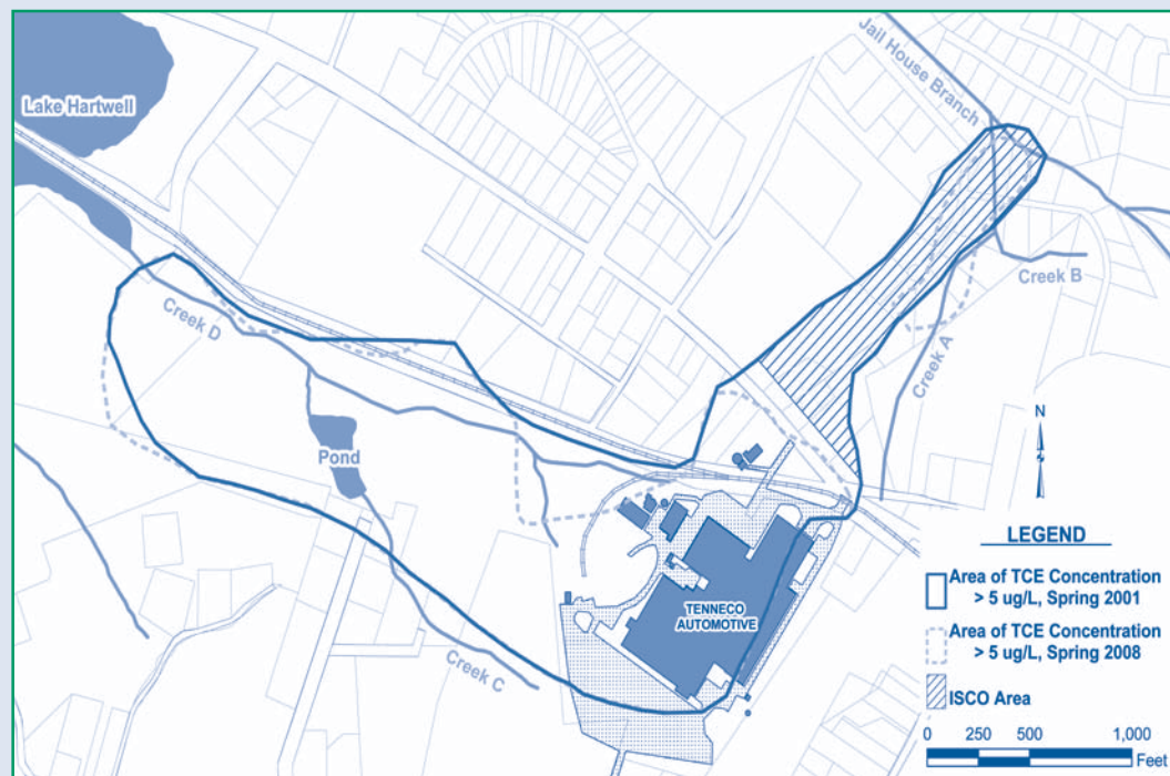
Figure 4. Groundwater flow from the bifurcated TCE plume is toward Lake Hartwell to the west and Jail House branch to the north of the Tenneco Automotive Site.