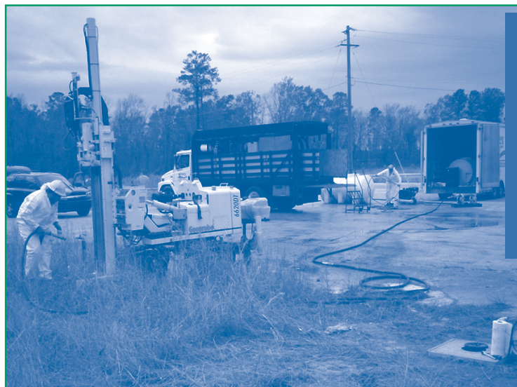
Figure 2. EVO and sodium lactate were injected into the subsurface and chased with water in one treatability study area at Site 89.