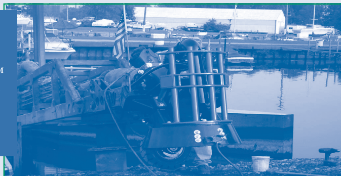
Figure 2. The 8-inch hydraulic dredge with attached Vic-Vac™ prepares to launch in target portions of the Ashtabula River AOC.