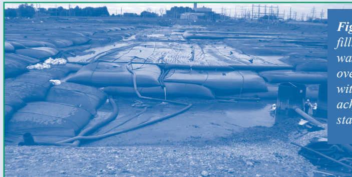
Figure 1. Prior to filling, each tube was placed in an overlaying pattern within the landfill to achieve a 10-layer stack.

Construction of the landfill, pipeline, and water treatment plant commenced in May 2006 and concluded in September 2006, at which time full-scale dredging operations began. Initial dredging operations were conducted using a 12-inch, 750-hp, hydraulic cutterhead dredge to remove sediment at a depth of 0-20 feet below water surface. The dredge operated at a rate of approximately 3,800-4,200 gpm and produced a slurry with 6-15% total solids by weight. Dredged material consisted of mostly fine-grained sediment, which was pumped through a 12-inch, double-walled, HDPE piping system installed along the Fields Brook corridor. Three 500-hp booster pumps were used to maintain a consistent flow along the entire length of the pipeline, which involved a 60-foot vertical rise between the river and landfill.