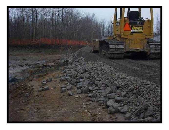
Figure 5: Roadway at Barker Chemical Site

• Establish work zones and traffic plans: Designating specific areas where site traffic is and is not allowed through the utilization of a traffic plan will reduce impacts on ecosystem services, as described previously for soil compaction. As illustrated in Figure 5, project managers can also construct compacted roadways restricting traffic to certain areas in order to facilitate transportation and reduce erosion. Plans should be made not only for onsite traffic but also for designating areas where site workers can and cannot utilize equipment. This will minimize unnecessary disruptions to sensitive areas and existing habitat.