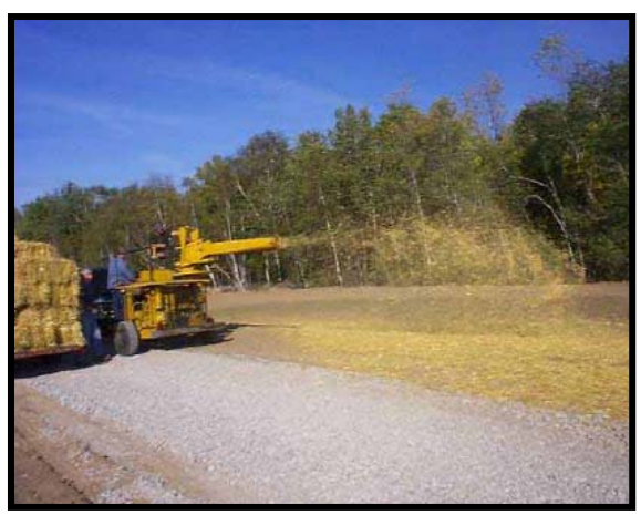
Figure 4: Reseeding the Barker Chemical Site

These suggested considerations may provide guidance and assist project managers in making difficult decisions. Setting of site priorities can also be done in terms of trade-offs. When looking at it from this perspective, a manager assesses what can be gained by protecting one service versus what would be lost by not protecting a different service (WRI, 2008). Project managers can evaluate what sectors of the community or ecosystem will benefit from the provision of a service and what sectors will lose out from the decrease of another service. Again, this process may be relatively easy if there are a limited number of services provided, although this is not always the case. If these considerations have not aided the decision-making process, then project