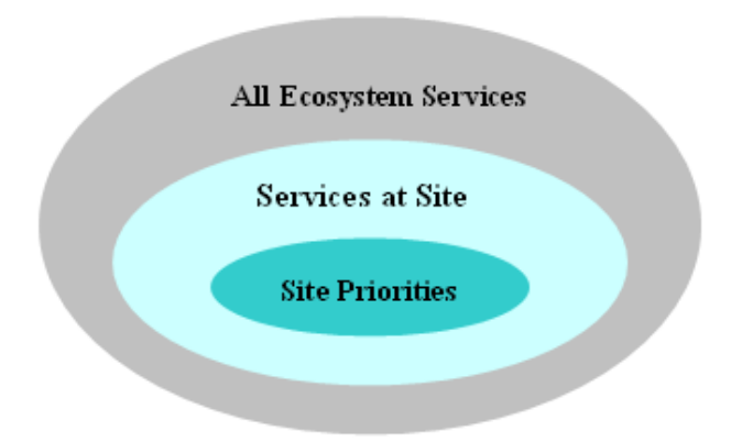
Figure 3: Service Identification and Prioritization

Once the site's ecosystem services are identified, decision makers can begin prioritizing the services. Since there may be a multitude of services provided by one site, it may not be possible to evaluate and mitigate negative remedial affects on each service due to circumstantial constraints such as lack of time or funding. This may especially be the situation at a larger site or a site that encompasses multiple ecosystem types. If this is the case, decisions will need to be made to determine which services are priorities to preserve or which require reduced impacts. This phase will involve evaluating the identified services and determining if they are relevant to the remediation process or to the community. Figure 3 is a simplified representation of the relationship between site priorities and services provided by the site. The site's priorities will be a subset of all the services provided by a specific site, which in turn are a subset of all possible ecosystem services. At this point, it may be beneficial to separate services that are intact from services which have been degraded from contamination. If the degraded service is being remediated during the cleanup process, it is a site priority and will not need to be separately addressed during this phase.