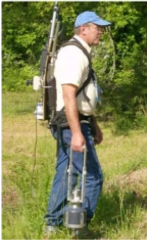
GWS measurements provided high-density spatial resolution regarding the presence or absence of uranium contamination.