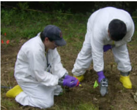
Locations for XRF and ISGS sampling and analysis were selected on the basis of initial GWS results. In turn, XRF/ISGS data then were integrated with GWS data to determine the spatial distribution of contamination.