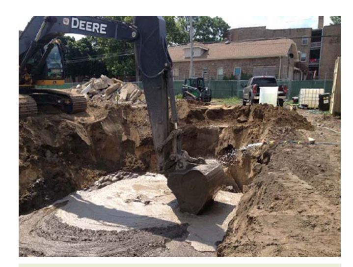
ISCO Reagent Placement: The ISCO reagents were transferred from the mixing trenches to the excavated hotspot areas where the reagents were spread into a single layer during backfilling with clean soil.