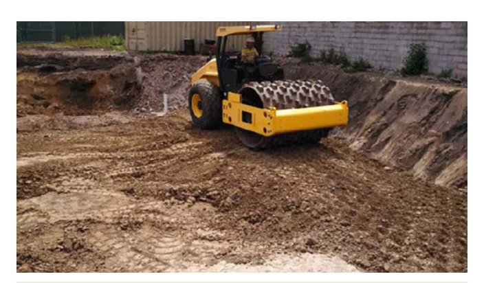
Clay Barrier Installation: Approximately 2,780 tons of clay, including 3 tons of bentonite, was compacted through use of a roller deployed in multiple rounds to achieve a 3-foot layer.