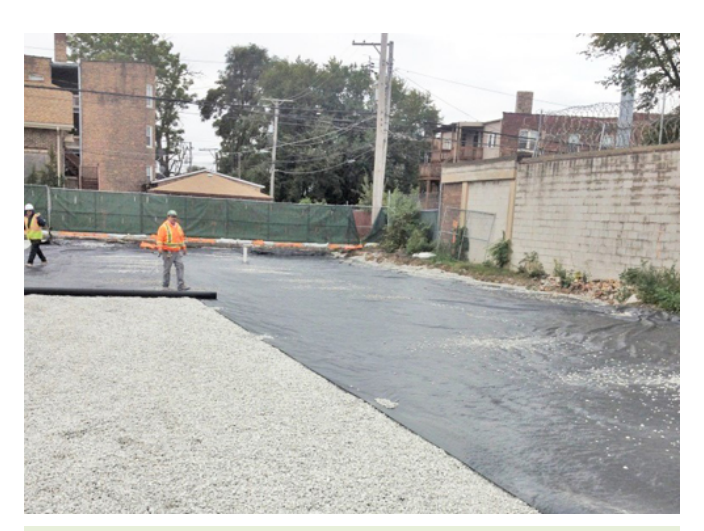
Geotextile Installation: Geotextile fabric was installed to protect the upper surface of backfilled areas and to serve as a filter around a stormwater detention basin.