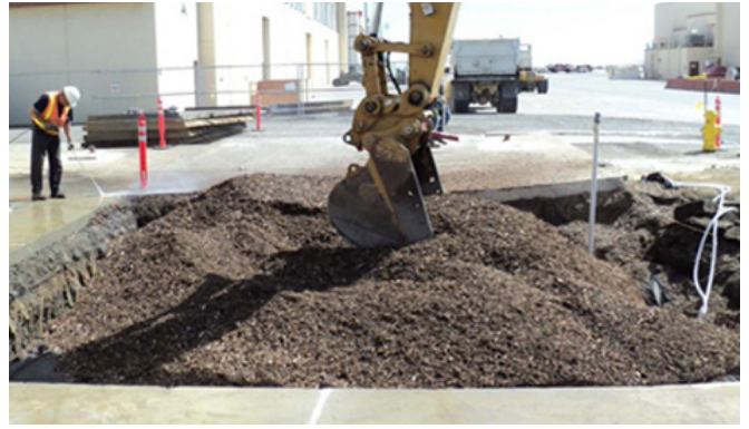
Confined Construction Areas: SBGR installation at Site SS016 involved placing mulch into an area that was surgically excavated, which minimized disturbance of previously built infrastructure.