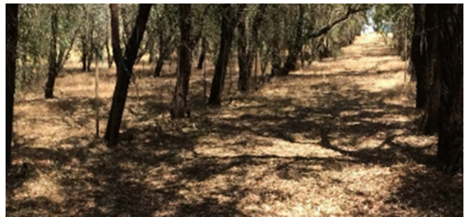
Phytoremediation Operations: The large stand of eucalyptus trees used for phytoremediation relies on infiltration of water into the root zone, which is supplied by the adjoining groundwater recirculation system.