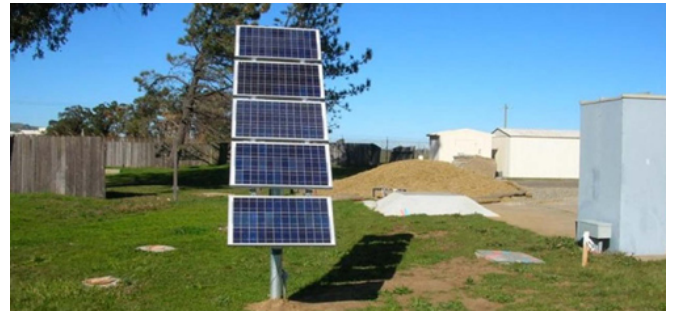
Solar-Powered Groundwater Recirculation: A dedicated, off-grid PV array provides the electricity needed to operate a pump that recirculates contaminated groundwater through each of three SBGRs.