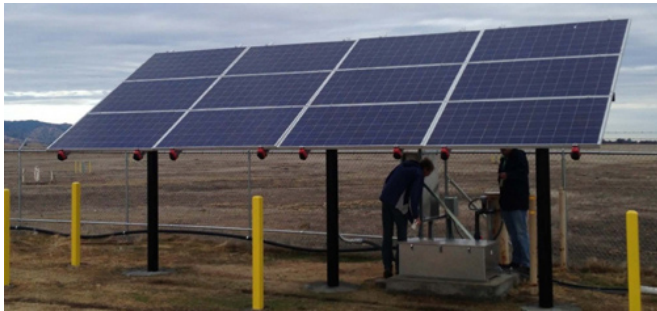
Site LF007C PV System: The ground-mounted PV array supporting P&T operations at Site LF007C consists of 12 panels equipped with a storage battery.