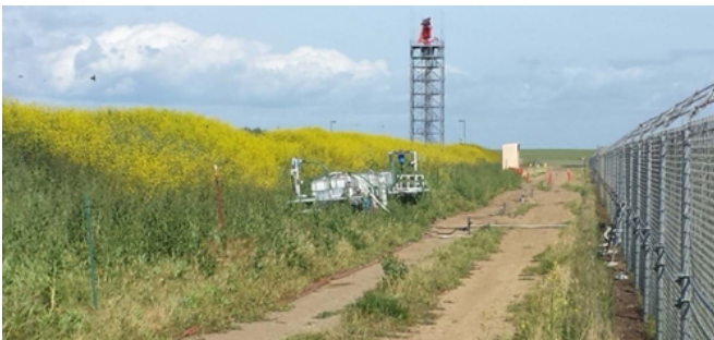
Use of Existing Infrastructure: In certain areas, EVO substrate is injected into wells positioned along existing infrastructure components such as unpaved roads, which helps minimize disturbance while continuing to meet cleanup goals.