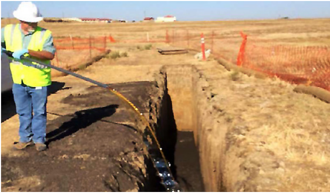
Carbon-Rich Waste: During construction of the FT004 SBGR, waste cooking oil was placed directly into the trench to serve as a source of the carbon needed for increased activity of contaminant-degrading microorganisms.