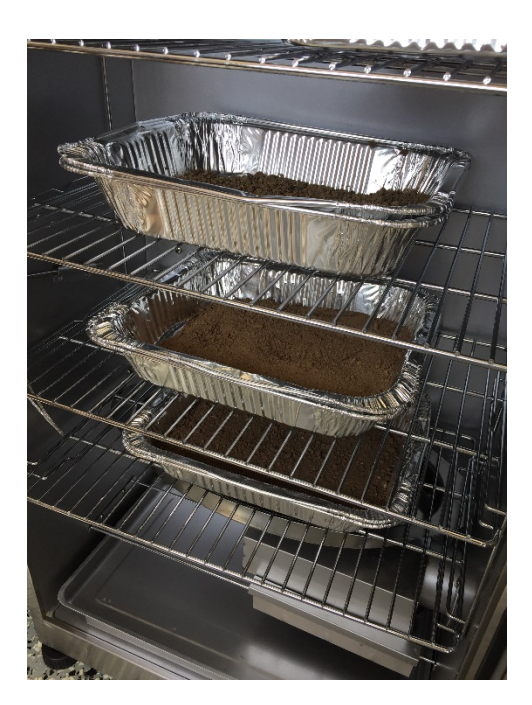
Drying ovens with soil samples inside (above)