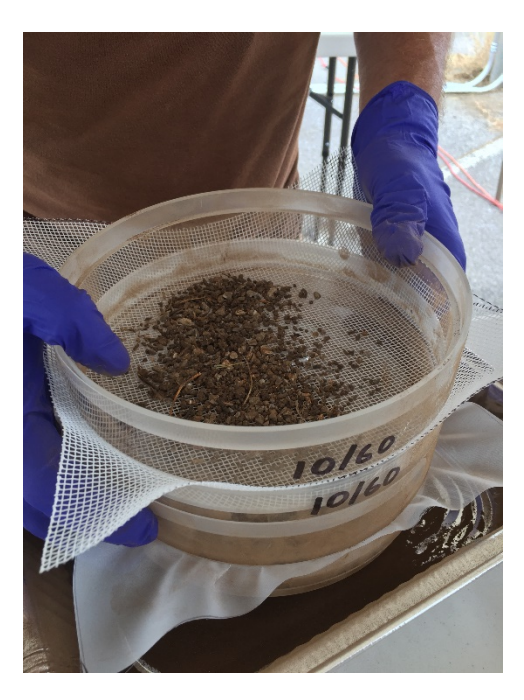
Stacked disposable sieves capturing the fraction

Soil samples being sieved under a fume hood.