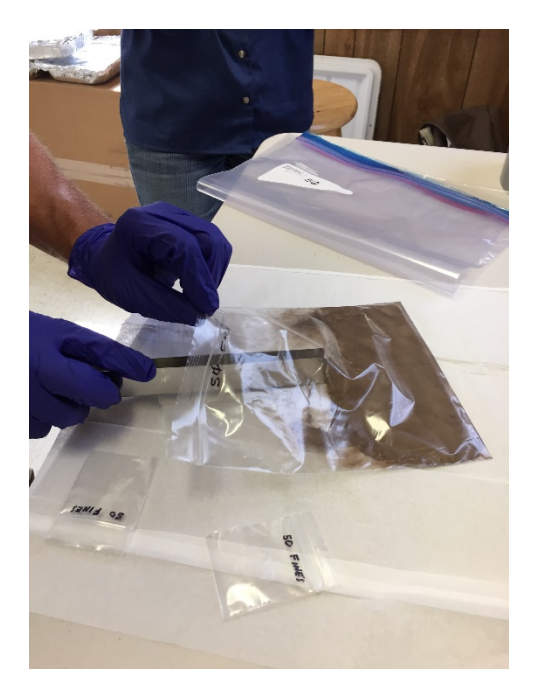
Subsamples taken from the parent fines soil sample.