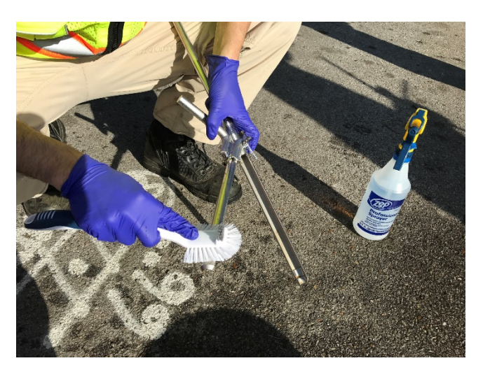
Decontamination of surface soil samplers.