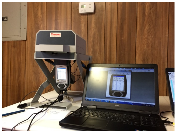
XRF stand connected to the computer with XRF screen replicated.