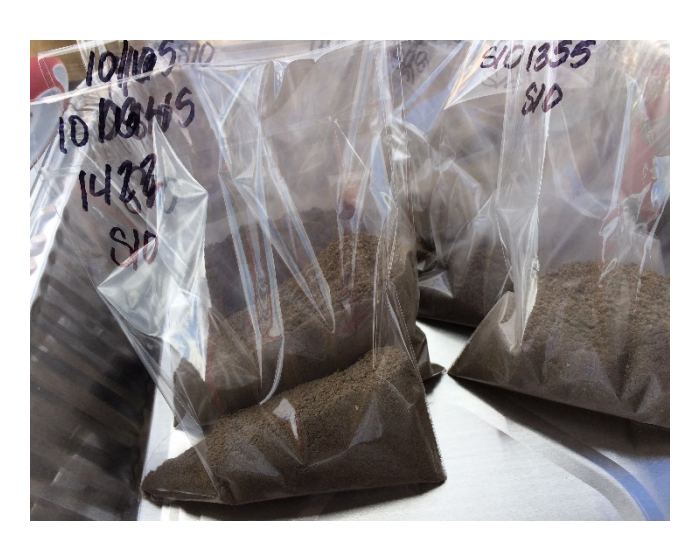
Sieved soil samples properly labeled and waiting XRF coarse readings.