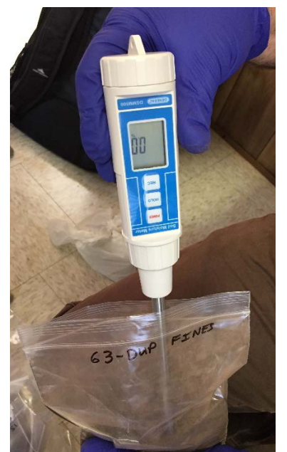
Figure 1: Obtaining a moisture reading using General Tools DSMM500 Precision Digital Soil Moisture Meter.