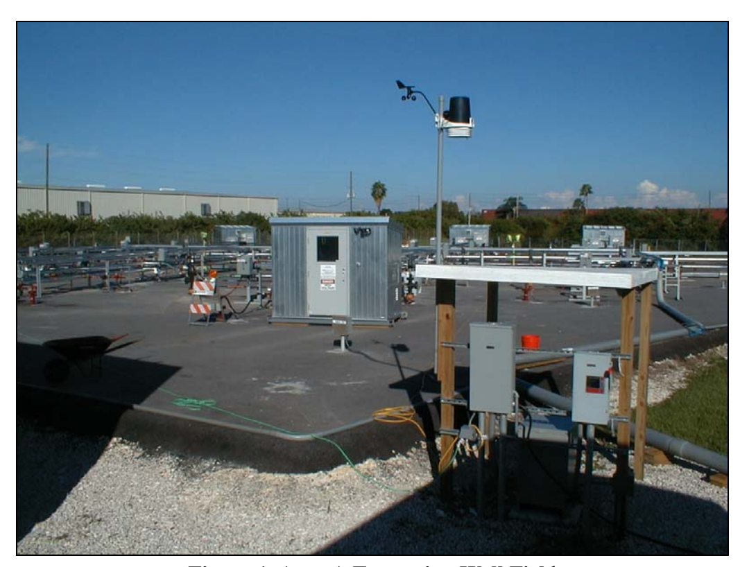
Figure 1. Area A Extraction Well Field

During operations, steam-enhanced extraction was used primarily to heat the sands in the alluvium, sweep the oily areas, and control vapor. ET-DSP was used to assist in directing steam flow and heating the lower clay layer; preheating an area with ET-DSP provided a preferential path for steam to flow. An extensive subsurface-temperature monitoring network was used to determine which areas needed additional energy. Temperature data were available on a project website where temporal trends and current temperature distributions could be viewed. During the entire operational period, vapor and liquid were extracted continuously from the subsurface. Figure 1 shows the extraction well field.