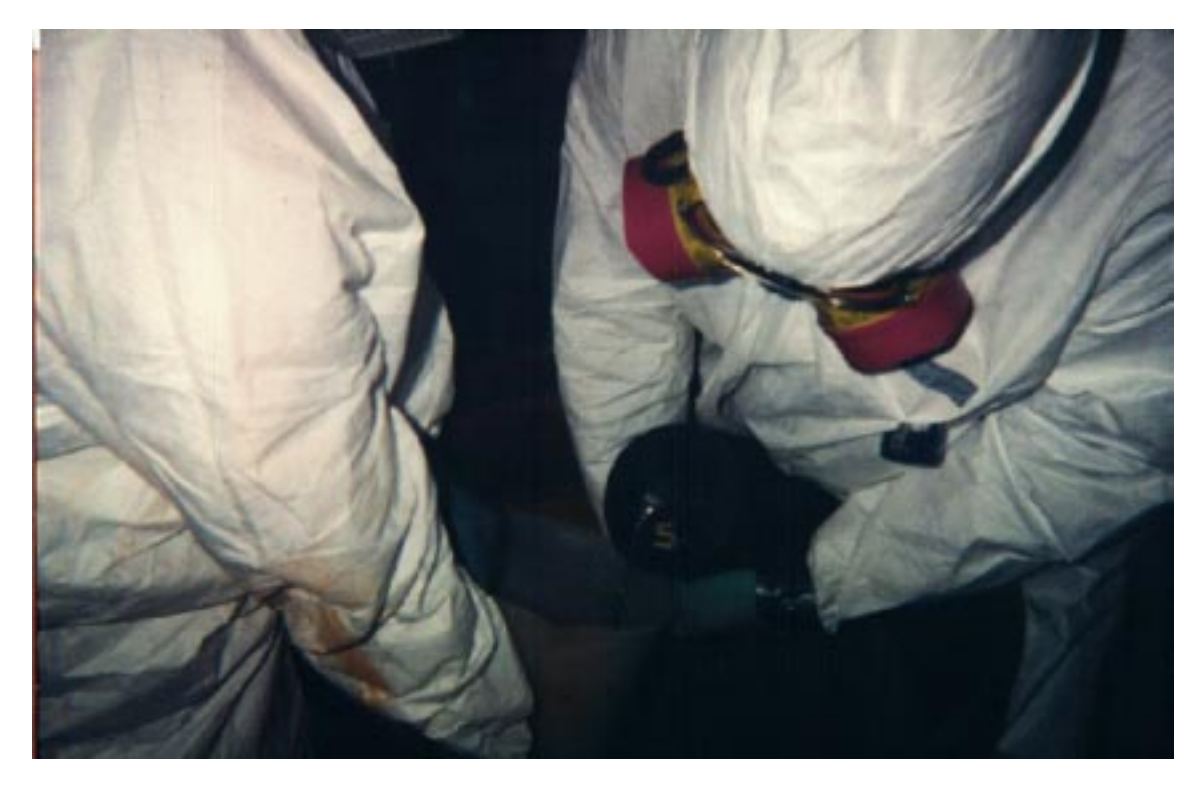
Figure 5. Sampling mercury before treatment.