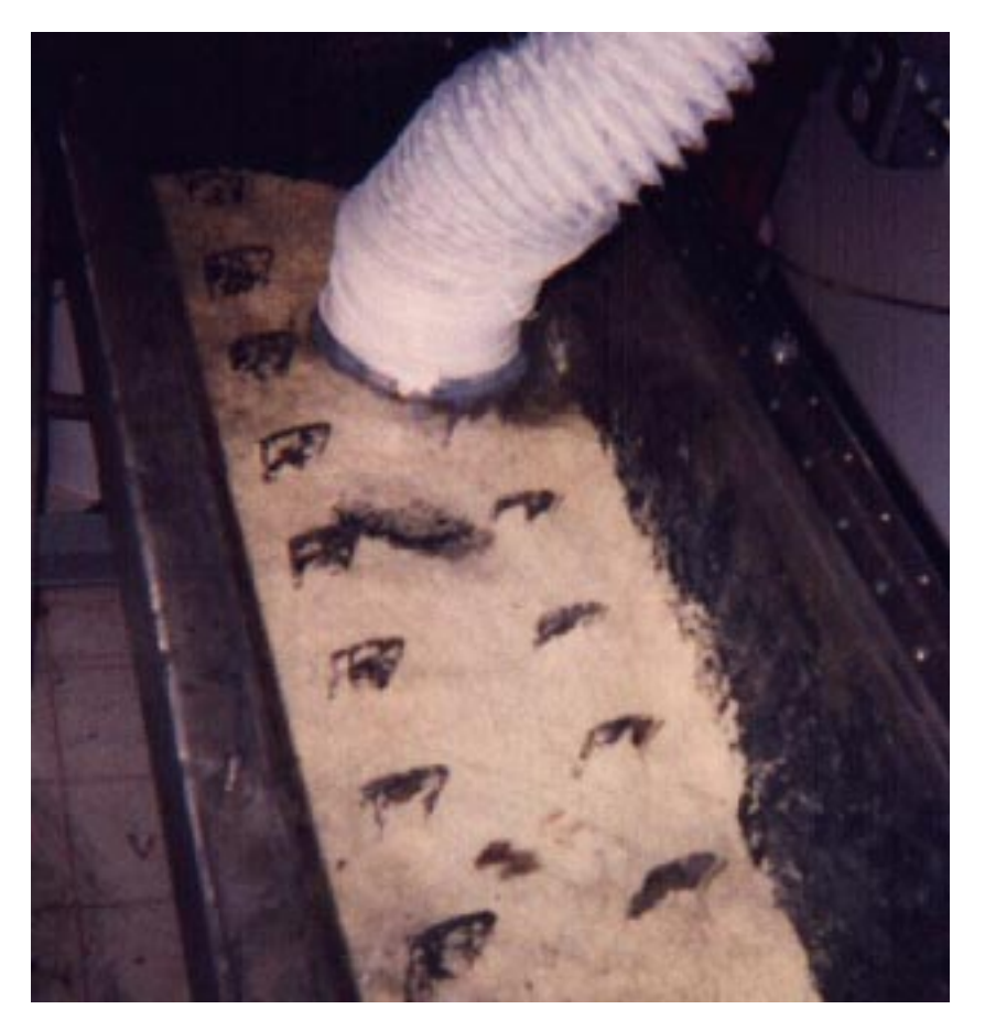
Figure 4. Sulfur in the pug mill before the addition of mercury.