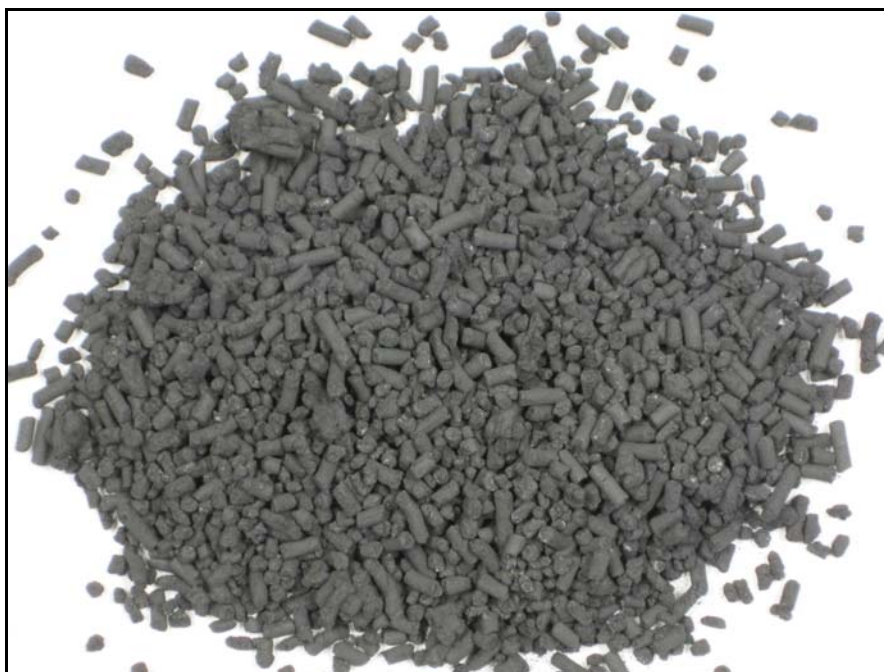
Figure 1. SediMite ® pellets containing powdered activated carbon (PAC). The pellet is an agglomerate that includes the treatment agent (PAC), a weighting agent (sand), and a binding agent. Once wetted, the pellet releases the fine-particle-sized treatment agent to sediments or wetland soils. SediMite ® can include PAC or any other treatment agent or mixture of agents that can benefit from pelletized delivery.