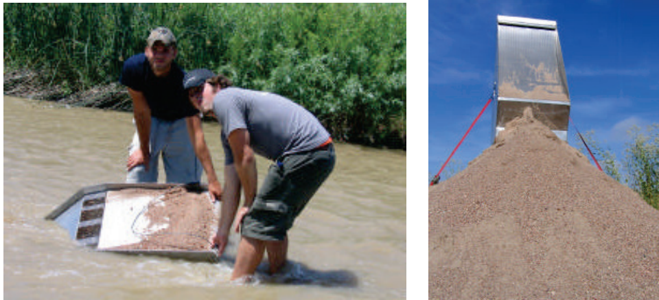
Figure 6. 2 ft collector and drop box used to estimate production rates.

Production rate was the key performance parameter measured. Prior to installation of the 30 ft bedload collector, a 2 ft bedload collector (Figure 6) was temporarily installed in Fountain Creek to estimate bedload transport extraction rates and assess optimal elevation for collector operation. The 2 ft collector pumped sediment into a drop box (Figure 6) that, in turn, allowed a 3 ft 3 container to be filled with the subsequent fill time noted to calculate a production rate. Sediment was collected over a 3-day duration with extraction rates at respective stream flows listed in Table 2. Assuming a linear extraction rate function for a longer collector, respective production rates were estimated for a 30 ft long collector and listed in Table 2 as well.