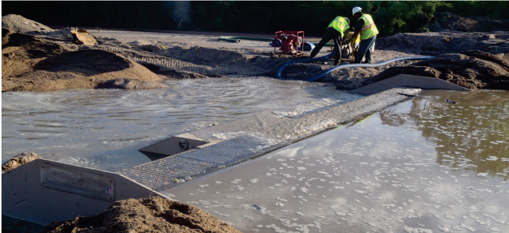
Figure 2. Sediment collector installed in Fountain Creek.