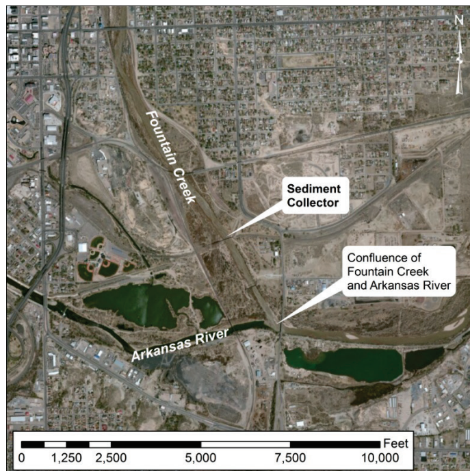
Figure 1. Location of sediment collector.

INTRODUCTION: The first of two technologies being evaluated under this RT is a sediment collector currently installed in Fountain Creek, Pueblo, CO, (location shown in Figure 1) intended to demonstrate technology to alleviate the need for dredging by lowering the downstream grade to reduce flooding and ultimately reduce sediment deposition as far downstream as John Martin Reservoir, a U.S. Army Corps of Engineers (USACE)-managed lake. The system operates on the principle that sediment in bedload can be trapped by gravity and removed at the natural rate of transport, instead of episodically. This DOER TN describes the technology and installation at Fountain Creek, other possible applications, lessons learned, cost, and provides some general guidance for applying collector technology at other sites.