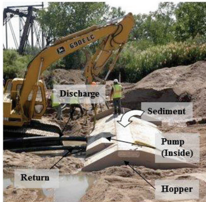
Figure 5. Installation of 30 ft long collector.

The primary component of the collector is a steel hopper (Figures 2 and 5) placed on the bottom along a sediment transport pathway. A manifold system inside the hopper focuses flow across a small region within the hopper, providing high velocities needed to entrain sediment. A dredge pump housed in the hull with the hopper pumps water and sediment through the manifold to the placement area. The pump can also be mounted remotely on land, the preferred configuration for maintenance. Booster pumps can be added to increase the pumping distance, as required.