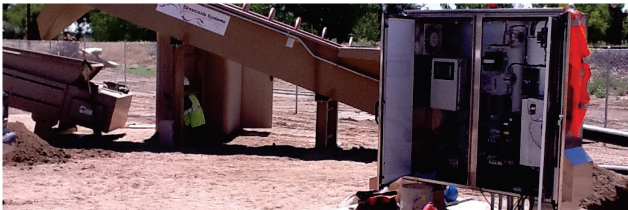
Figure 4. Electronic control panel and Archimedes screw separator.