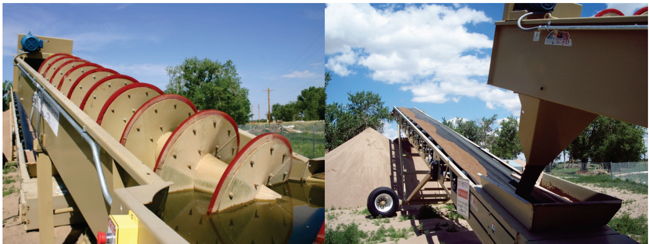
Figure 3. Archimedes screw separator (left) and stacker (right).