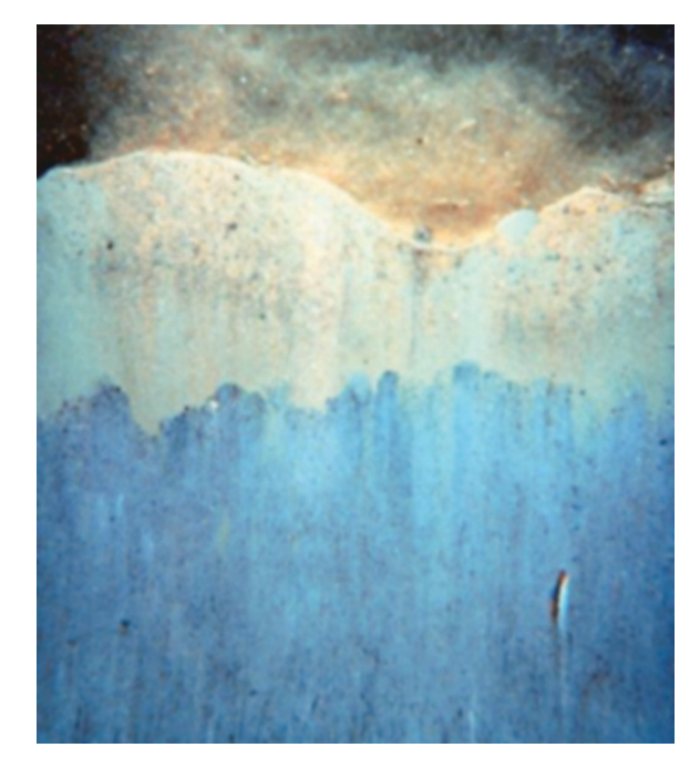
Figure 3. Well-mixed, oxic sediments overlay reduced sediments in a freshwater habitat. An oligochaete can be seen at a depth of about 10 cm