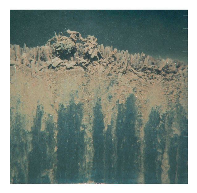
Figure 1. Cross section of the sediment/water interface (approximately 15 by 15 cm), showing a dense assemblage of amphipod tubes at the surface