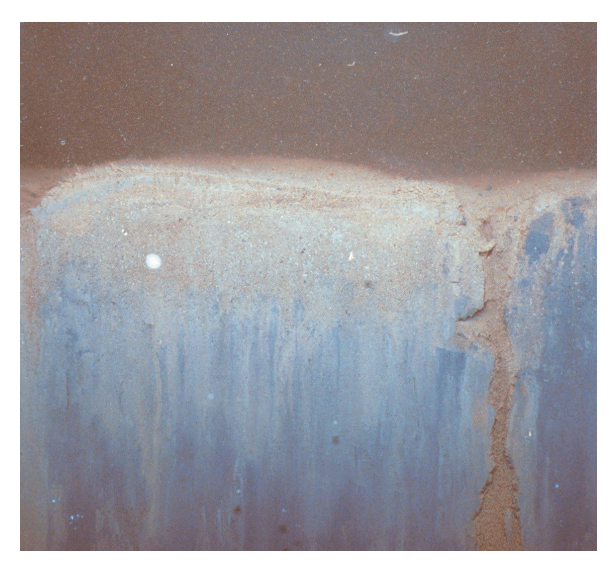
Figure 5. A large vertical burrow, possibly constructed by a mantid shrimp, extends downward through the sediment column

coastal environments. The significance of bioturbation processes in freshwater ecosystems is also well-established (McCall and Tevesz 1982). Several aspects of bioturbation in both saltwater and freshwater environments are acknowledged to be important gaps in the pertinent state of knowledge. First, while the role of infauna (i.e., organisms dwelling in intimate association with the sediment matrix) within the uppermost 30 to 50 cm of the sediment column is relatively well studied, the role of deep-burrowing (>50 cm) invertebrates remains unquantified. For example, echiuran worms are known to build large burrows to a depth of up to 80 cm in muddy sediments (Hughes, Atkinson,