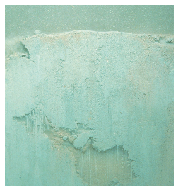
Figure 4. A large feeding void, created by head-down deposit feeding polychaetes

increased pore-water exchange. Late stages of colonization are often dominated by less dense assemblages of large organisms, many of which feed in a head-down position at sediment depths approaching 30 cm (Figure 4). These "conveyorbelt" feeders ingest sediment at depth and defecate at the surface, thereby moving appreciable volumes of sediment. This very concise summary of benthic community succession captures very general trends, as described in Pearson and Rosenberg (1978), Rhoads and Boyer (1982), and Rhoads and Germano (1987); but the actual sequence observed in the field can vary greatly. Also, this description pertains largely to colonization of unconsolidated sediments, whereas succession in sandy sediments, although likely to follow similar patterns, is less well understood.