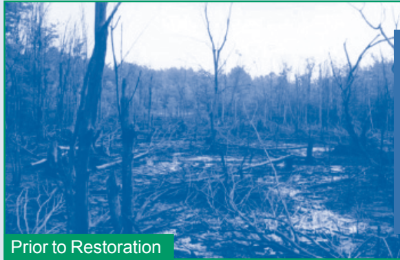
Prior to Restoration