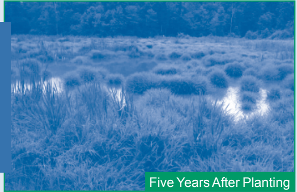
Five Years After Planting