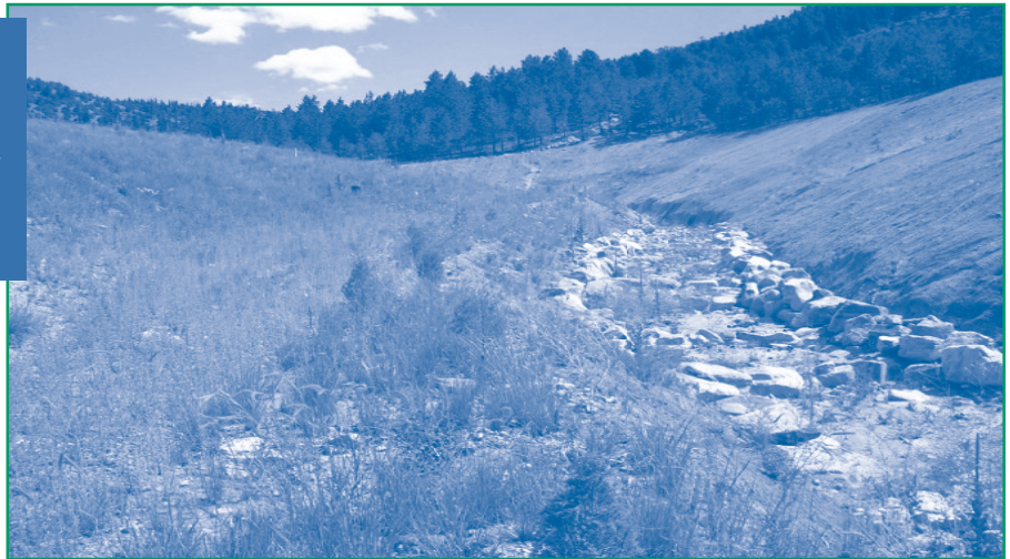
Figure 2. The ecological approach used to address AMD in the Balarat Gulch relies on revegetation with native plants to help stabilize banks of the diversion channel constructed four years ago.