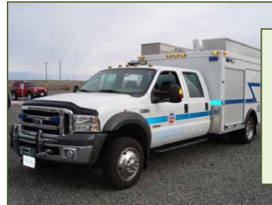
Retrofitting of this emergency response vehicle with a DMF was completed in 2008 as part of EPA Region 10’s ongoing clean emission initiative.

DOC, DPF, and pDPF equipment often is combined with closed crankcase ventilation technology, which reduces HC and PM emission from an engine crankcase or oil pan.