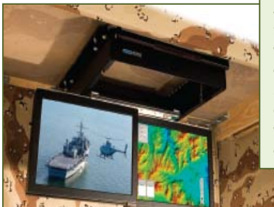
Solar-powered telecommunications and video display systems can be installed in cab bulkheads, for easy access to site maps without a need for engine idle.

Other onboard technologies include commercial micro-solar units, which can be tailored to operate equipment traditionally relying on engine idling that provides battery power. An inexpensive 5-watt photovoltaic panel, for example, can be installed below the rear window of a passenger car and connected directly to a vehicle’s battery to power local communications or radios.